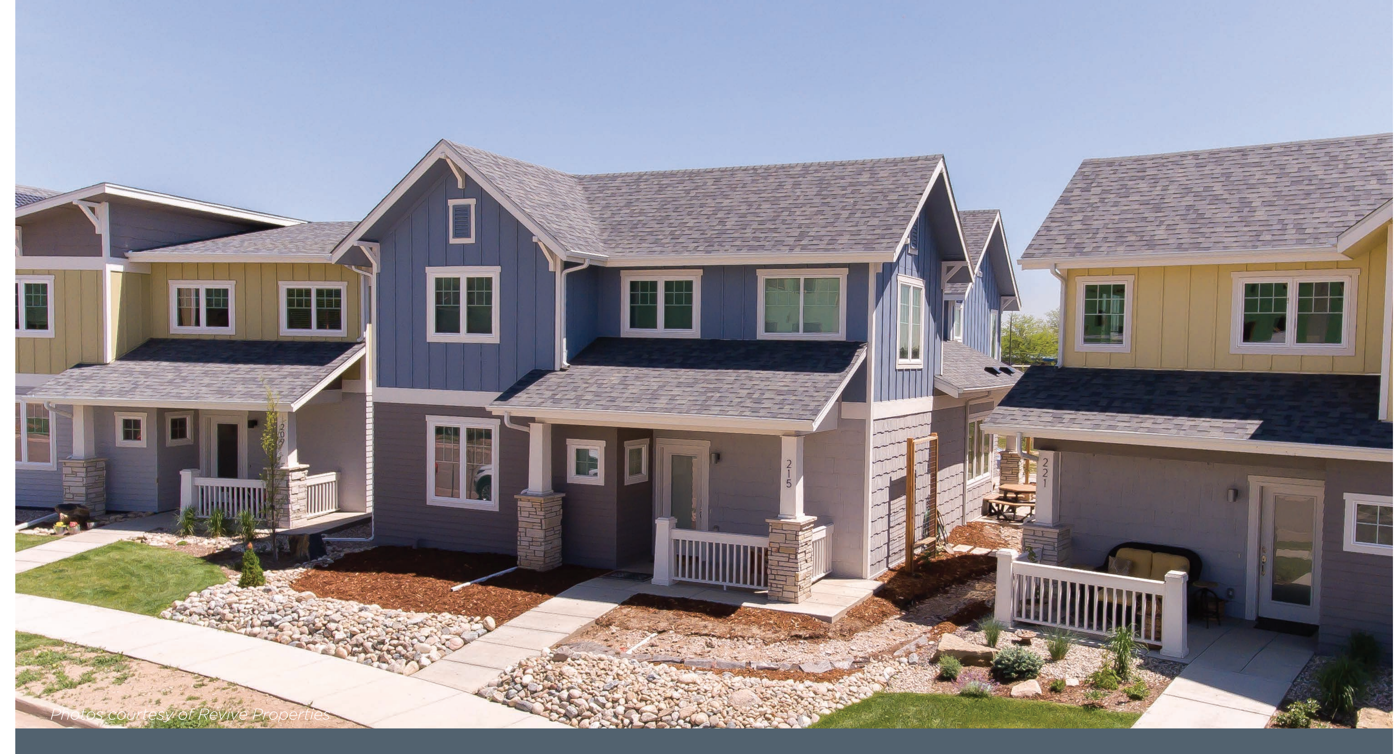
"We are always comfortable, with little in the way of temperature adjustment. It is also very quiet and efficient." Home owner

The Stanley Model | Fort Collins, CO | ReviveFC.com